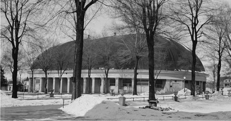
The Salt Lake Tabernacle on February 20, 1937. The Utah Chapter of the AGO was chartered in 1937.