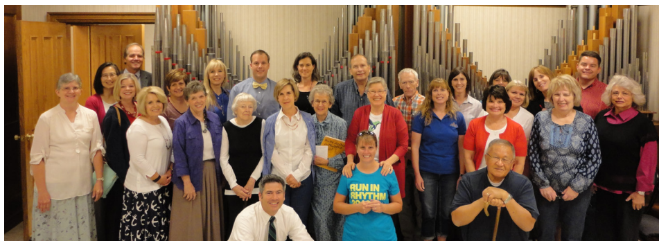
SLCAGO members and instructors in front of the Austin practice organ in the basement of the Assembly Hall on Temple Square at the August 2016 certification workshop.