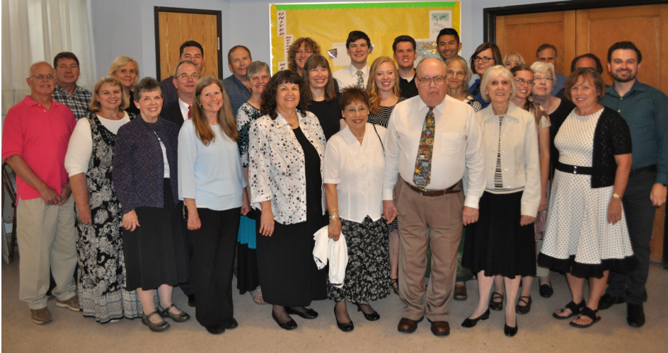
SLCAGO members at the opening social event on Sept. 11, 2016 at First United Methodist Church.