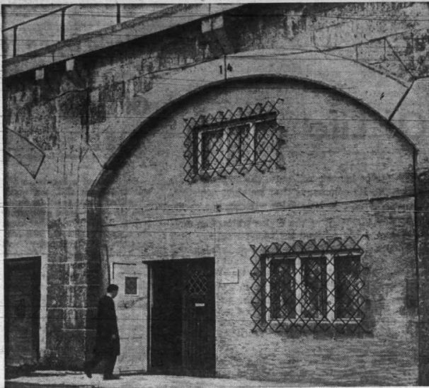
Many faith-promoting meetings were held in this meeting place for the Innsbruck members although it was built under a railroad right-of-way over which trains thundered at various times of day.